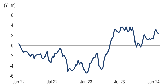
Chart 2: Cumulative Trading Value by Overseas Investors (since Jan 2022)

Source: Japan Exchange Group; compiled by Daiwa.