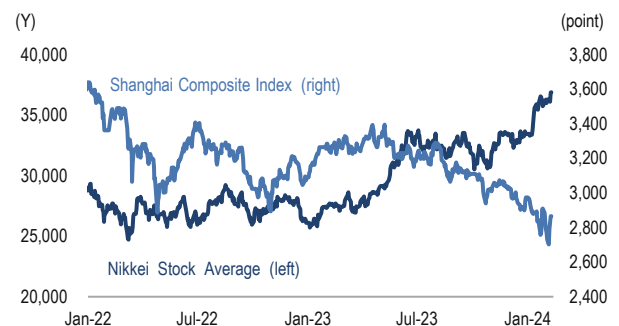
Chart 4: Nikkei Stock Average, Shanghai Composite Index