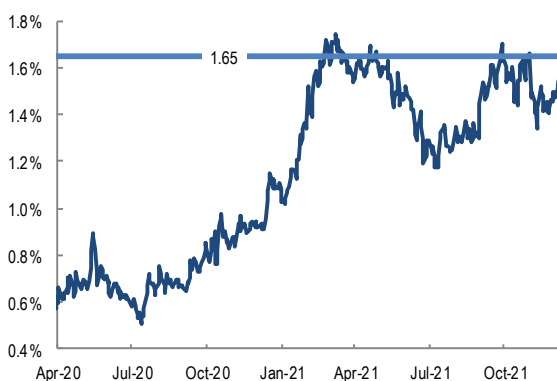
10Y US Treasury Yield