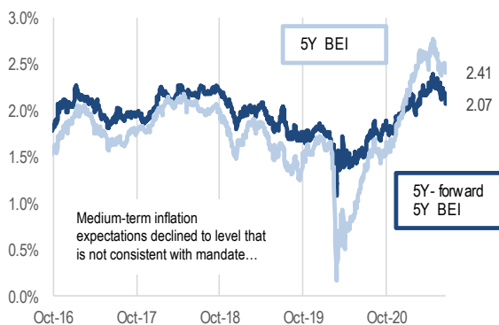
US Treasury Breakeven Inflation Rate