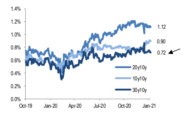
10Y-, 20Y-, 30Y-forward 10Y JGB Yield