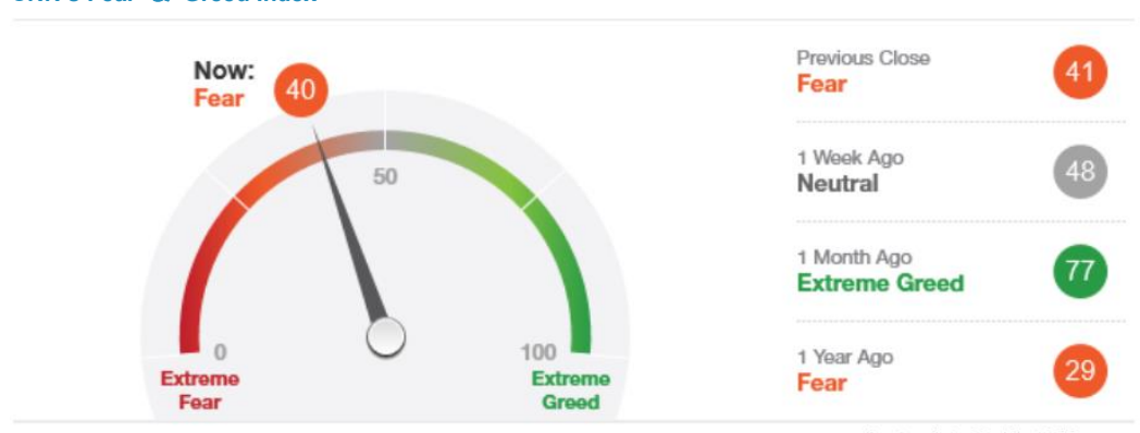
CNN's Fear & Greed Index

The CNN's Fear & Greed Index, an indicator for investor sentiment, worsened to a "fear" level at the end of last week, although I do not think this happened because of the aforementioned factors alone. Given the fact that the index was at an extreme greed level one month ago, we can say that investor sentiment has worsened sharply. As investor sentiment swings easily, accumulation of bad news may delay a recovery of sentiment.