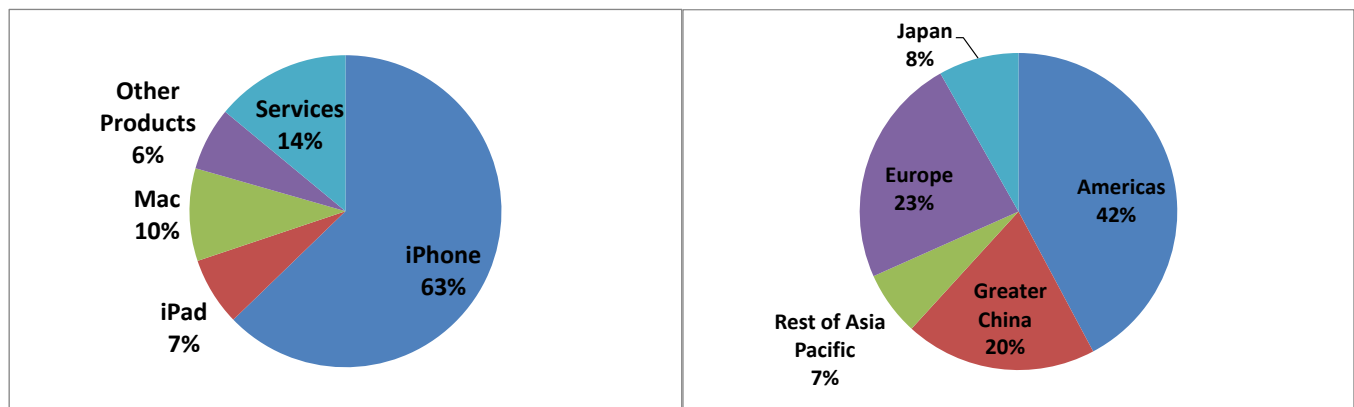
Chart 1: Breakdown of annual revenues(end of FY18) by products/ geographic segments